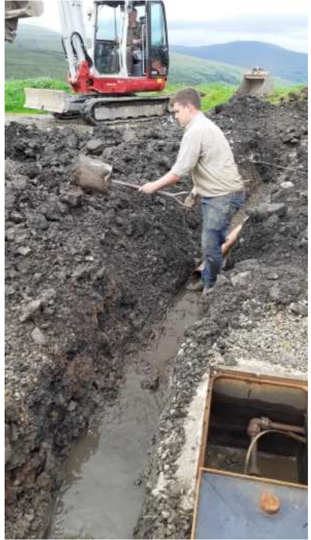
Locating existing service cables and pipes