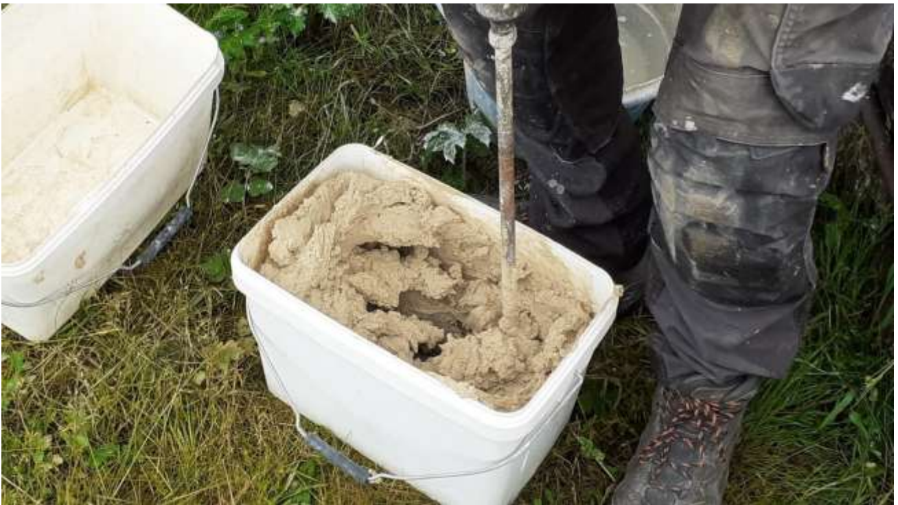
Mixing lime mortar