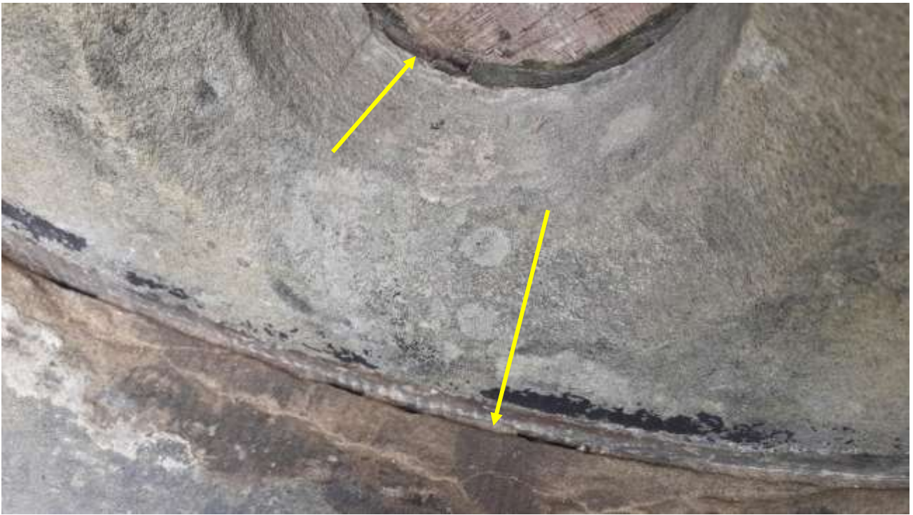
Showing possible points of ingress