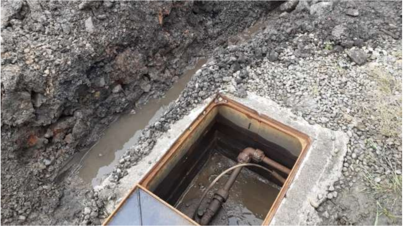
Manhole now drained.