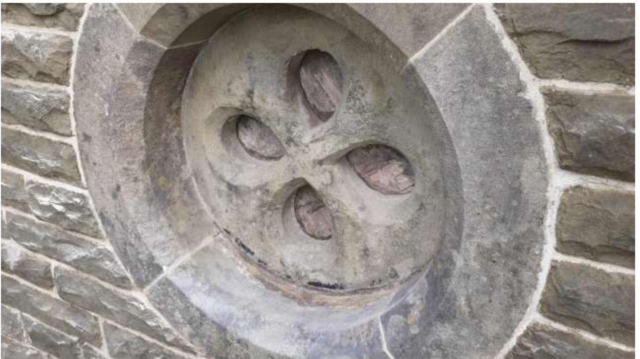
Investigation of water ingress possible cause thought to be bulls eye window at high level: