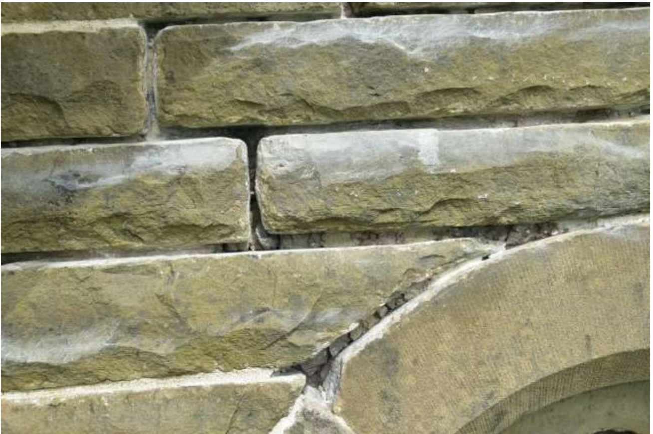
Cutting out joints around west window