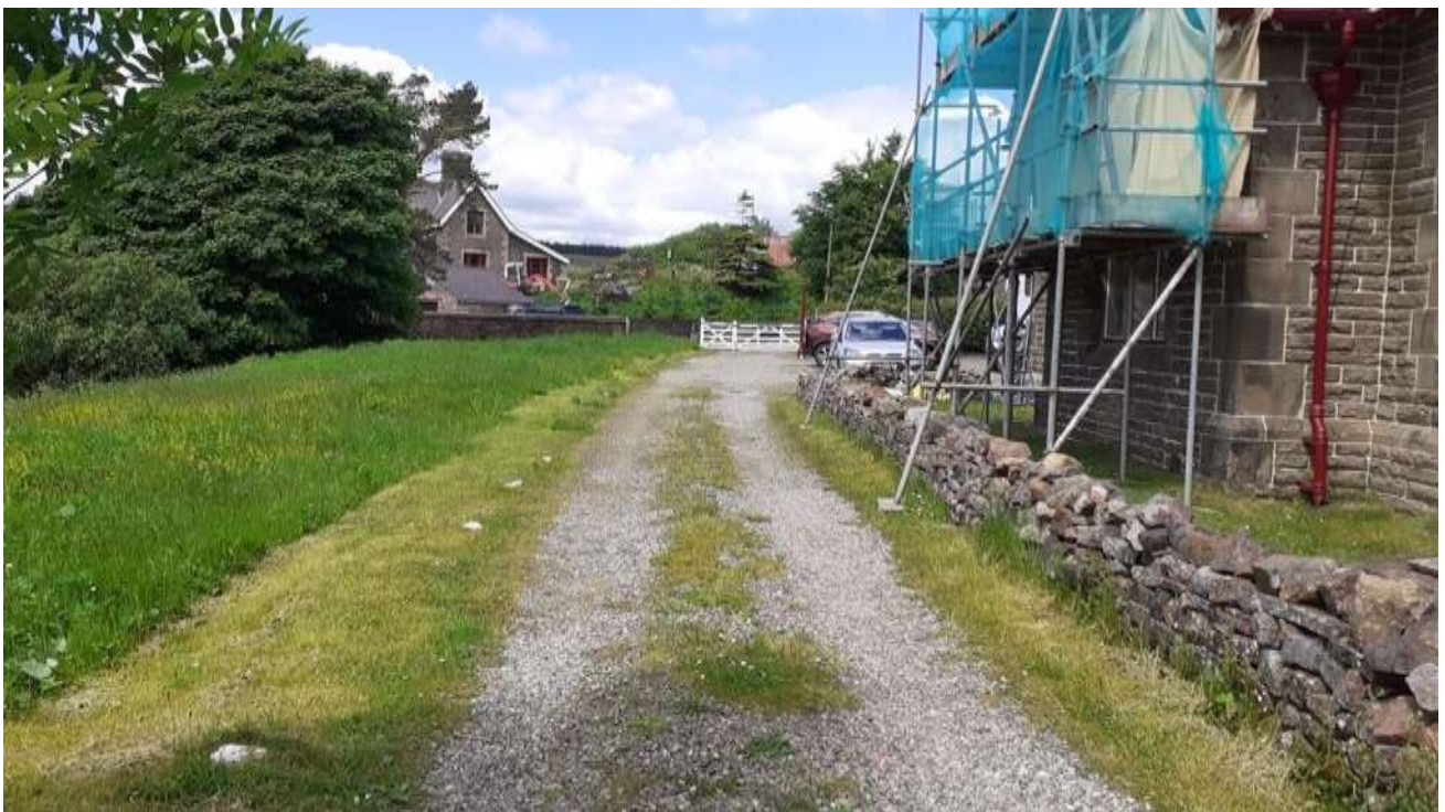
Driveway border mowed

31 st May: pointing to platform gable ongoing at lower levels; preparation of two bunk room windows commenced.