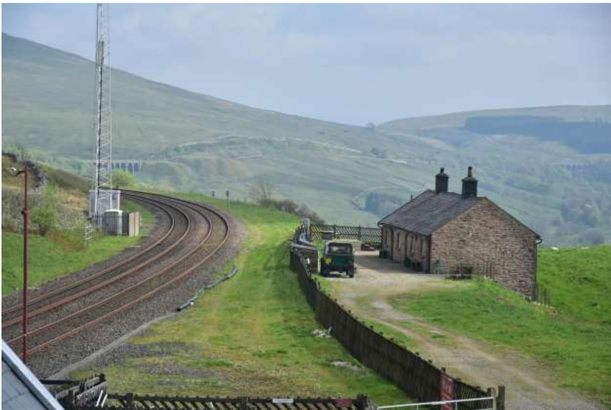
The view from the scaffolding