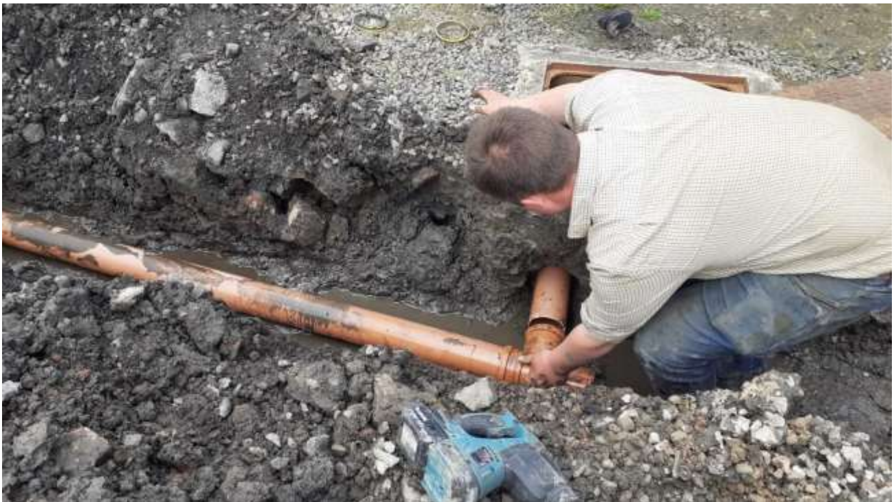
Installation of perforated pipe