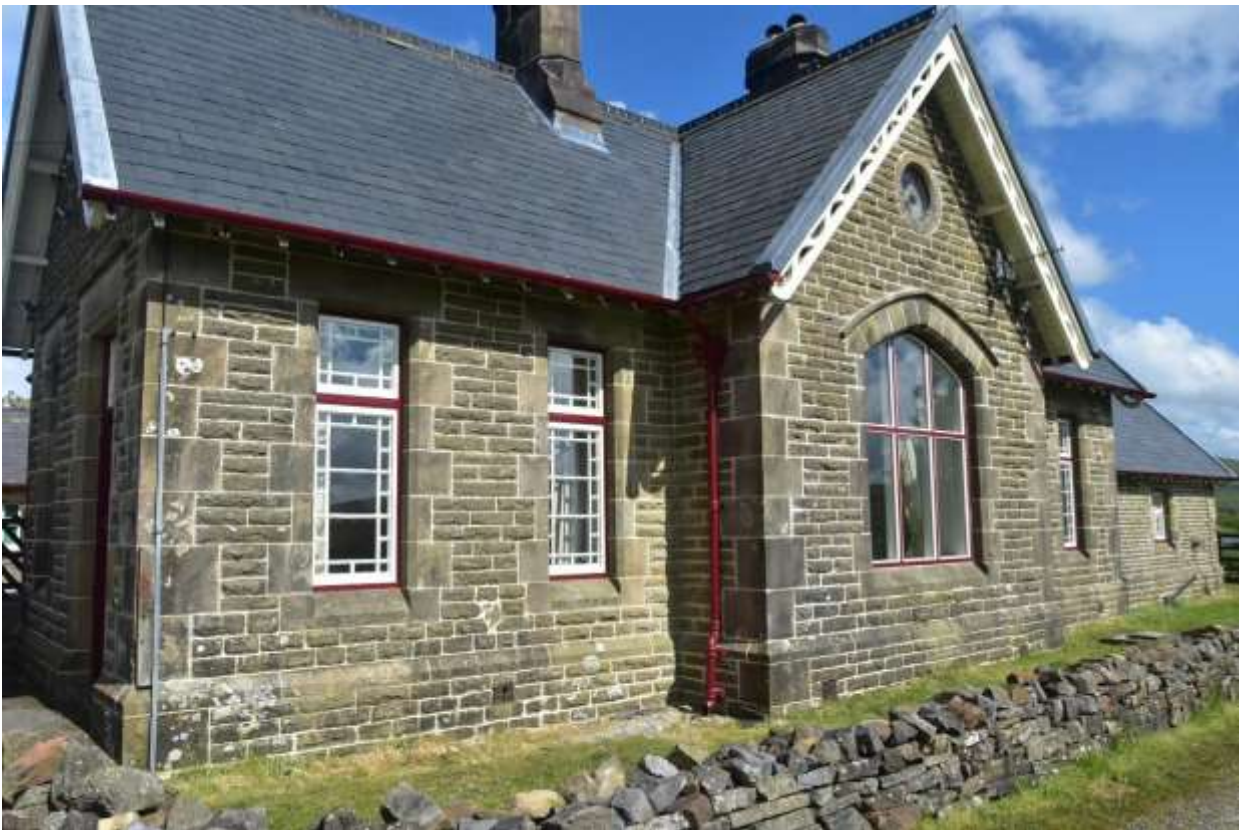
Showing completed redecorated windows (to bunk room)