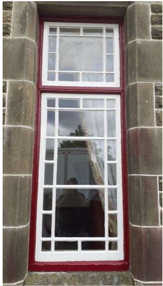
23 rd May: repointing w/c block continuing; water system serviced (Steven Graham – Cumbria Pumps)