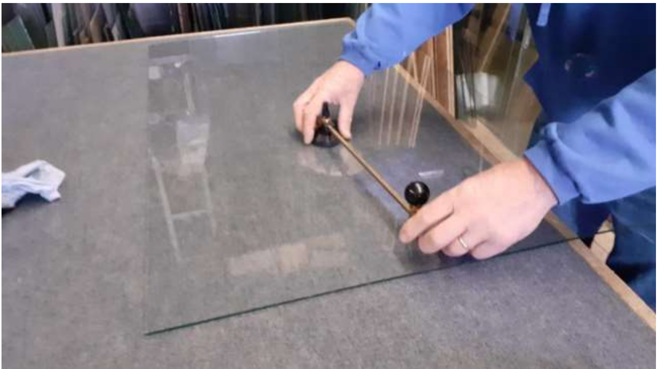
The possible solution: a pane of glass (Guiseley Glass)