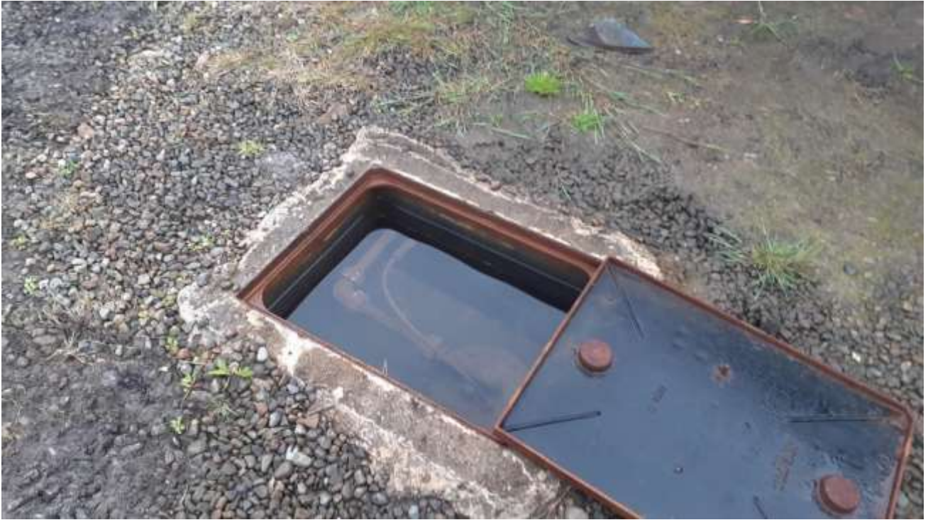
Manhole to borehole for water supply before drain installed: borehole head can be seen as sealed unit below the water.