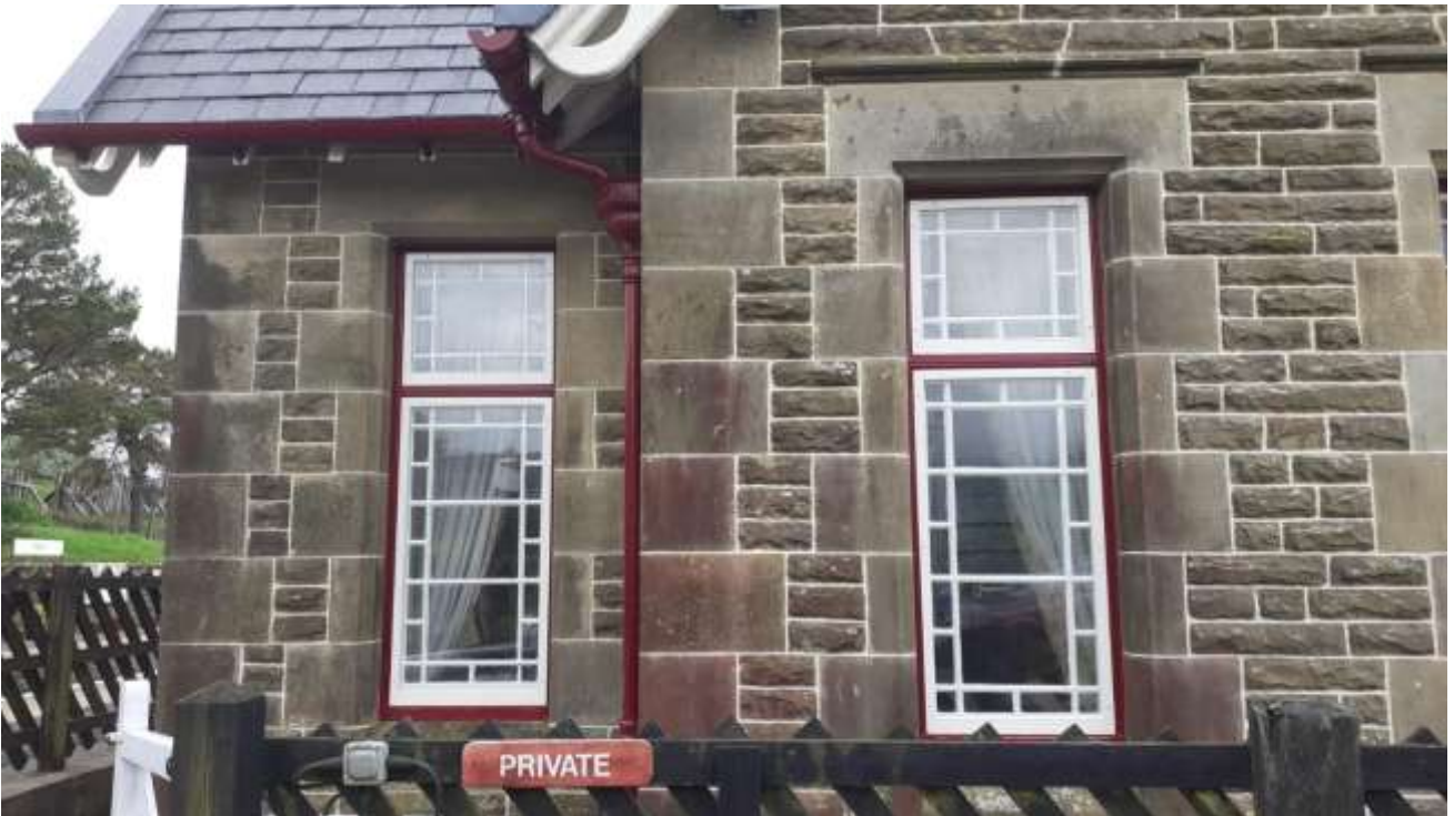
Redecorated main bed windows.