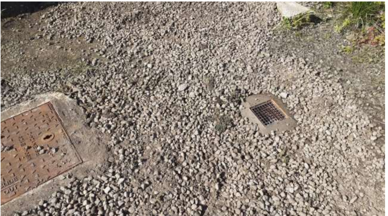
And finished job complete with surface water gully.