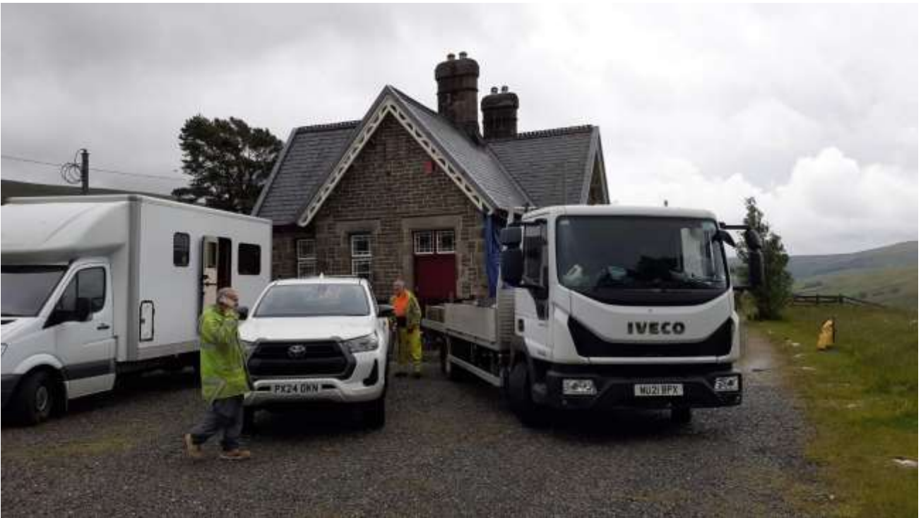
Final removal of the scaffolding by Cumbria Kendal at 1145